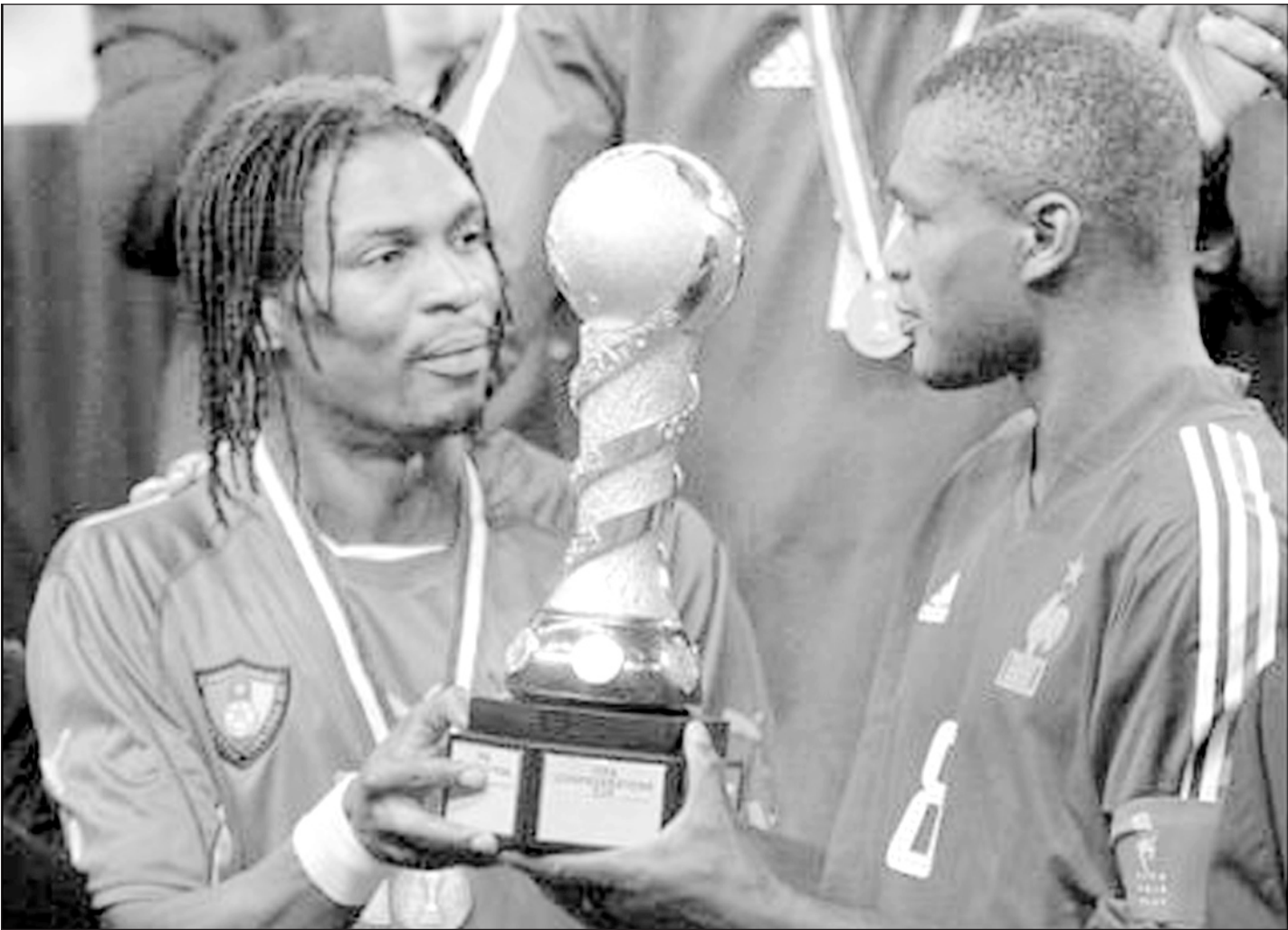
France captain Marcel Desailly (R) holds the Confederations Cup trophy with his Cameroon counterpart Rigobert Song after the final at the Stade de France in Saint-Denis on June 29.