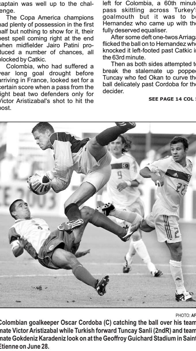
Colombian goalkeeper Oscar Cordoba (C) catching the ball over his teammate Victor Aristizabal while Turkish forward Tuncay Sanli (2ndR) and teammate Gokdeniz Karadeniz look on at the Geoffroy Guichard Stadium in Saint-Etienne on June 28.