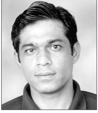
Rashid Latif (Pakistan cricket captain) "We are going through a rebuilding process which will take some time."