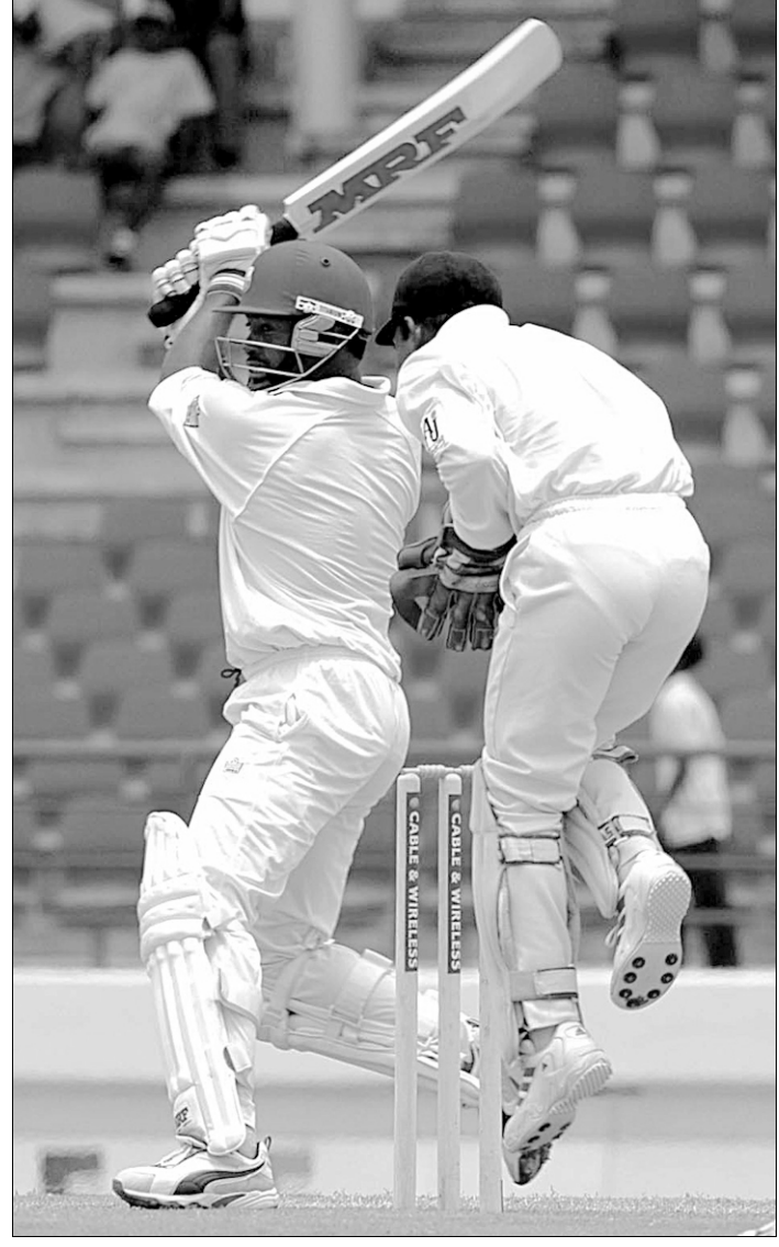
MAN-OF-THE-MATCH: West Indies captain Brian Lara follows through on a cut during his knock of 209 against Sri Lanka on the fifth day of the drawn first Test in St. Lucia on June 24.