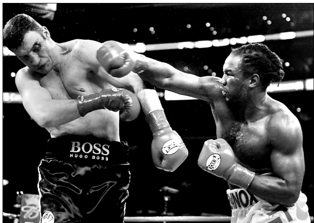
World heavyweight champion Lennox Lewis lands a right hand on Vladimir Klitschko from Ukraine during their title bout on June 21.

Brazil striker Adriano (R) scores the winner against USA at the Gerland stadium in Lyon on June 21.