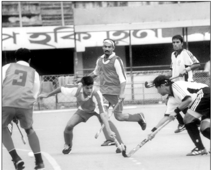
Action from yesterday's Club Cup hockey tournament clash between Mohammedan Sporting Club and Wari Club at the Maulana Bhasani National Stadium.

2002: Leyton Hewitt becomes first Australian champion since Pat Cash in 1987 beating David Nalbandian of Argentina in straight sets. Serena Williams meanwhile ousts Venus - just as she had at the French Open.