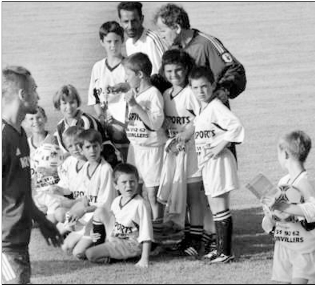
A DIFFICULT CHOICE! French ball boys and girls turn their heads to look at Japan's star playmaker Hidetoshi Nakata (L) while they prepare for a group photo with the team's Brazilian coach and legendary player Zico (black suit) after a training session at Stade Marcel Coene in Montataire on June 16.

"I like Japan from the bottom of my heart and that's why I took up the offer to coach them because I thought I could do something for them."