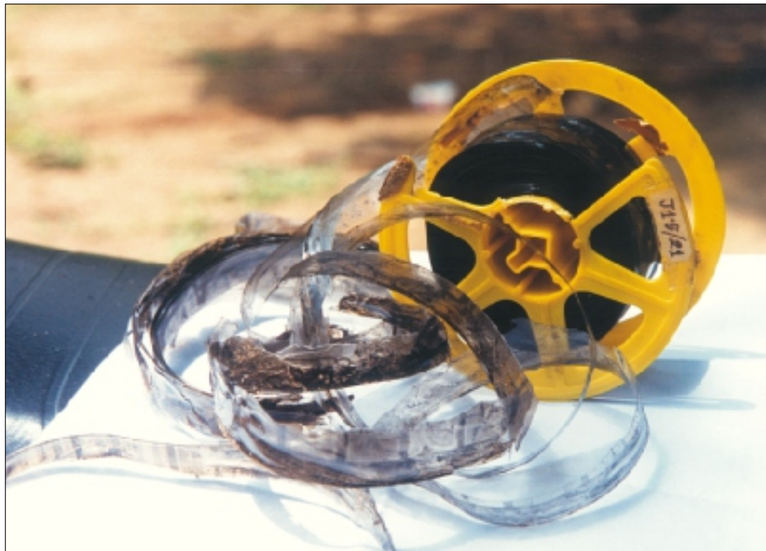
A microfilm on valuable reference of the Dhaka University Central Library lies damaged. About 200 rare manuscripts and at least 500 microfilmed newspapers have already been damaged and more are on way to meet the same future due to negligence of the authorities.