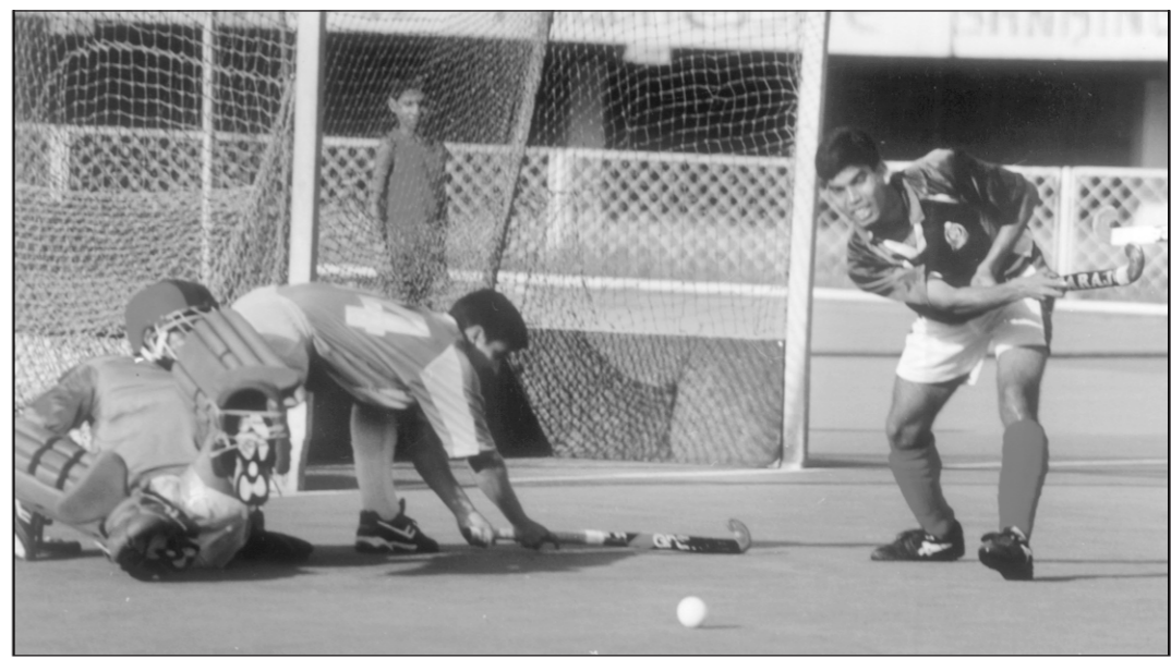
A goal-mouth action during the Club Cup hockey tournament match between Abahani and Victoria at the Maulana Bhasani National Stadium yesterday.