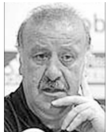
VICENTE DEL BOSQUE