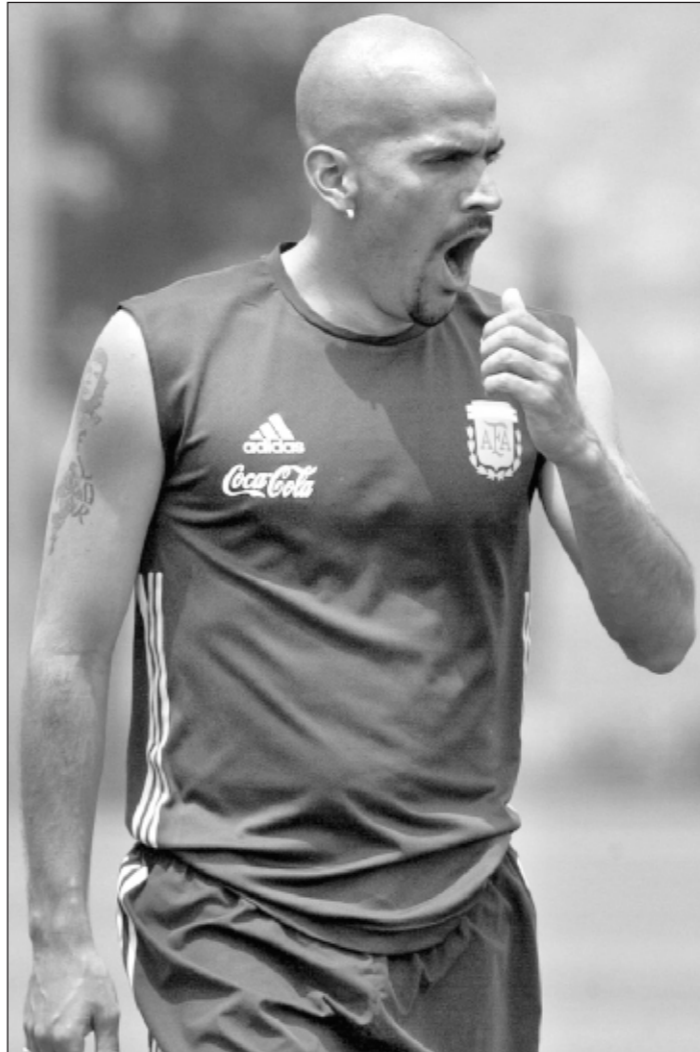
JUAN SEBASTIAN VERON

his contract and any potential deal would be affected by David Beckham's proposed move to Barcelona or Real Madrid.