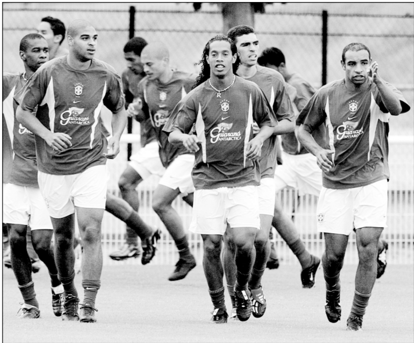
Brazilian players practice at the Camp des Loges camp near Paris yesterday ahead of the Confederation Cup.

Spanish international Guti will consider leaving Real Madrid if David Beckham joins the club and a move to England would be his preferred option. "I'm at a point in my life where I need to play," Guti told TeleMadrid radio. "If Beckham came I'd have to be realistic and think that there wouldn't be many chances for me." Manchester United have already signalled their willingness to sell Beckham to Barcelona if Joan Laporta wins Sunday's presidential election and can then persuade the England captain to come. Real Madrid are widely expected to enter the bidding as soon as the Spanish league title is won or lost and a move to the nine-times European champions could be more attractive to Beckham. Guti is a Spanish international regular but he has a hard enough time getting into the Real Madrid first team as it is and he recognised that the arrival of Beckham would make him look towards the Premier League. "I've always thought that if I left Spain I'd like to play in England," he said. "Playing there for a few years would be a good option." Beckham is due back in England from the U.S. later on Saturday before heading out to Asia next week on another promotional tour.