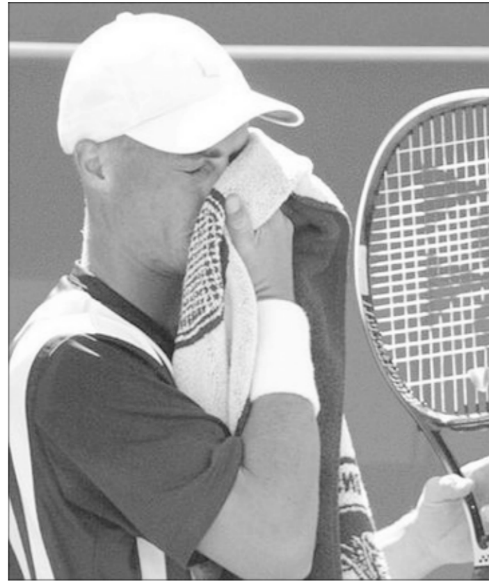
Australia's Lleyton Hewitt wipes his face after losing to French Sebastian Grosjean at Queen's Club in London on Friday.

Tennis AFP, London Lleyton Hewitt saw his hopes of an unprecedented fourth successive Queen's Club grasscourt title ended by Sebastian Grosjean in the quarterfinals here on Friday.