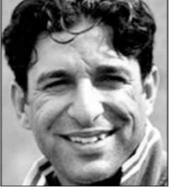
WASIM AKRAM 2. Matches start at 5.30pm (although there might be some changes to fit in with television schedules), with a 15-minute interval before the start of the second innings at 7.00pm. 3. Each innings should last no longer than 75 minutes. 4. Teams will incur a six-run penalty if they fail to bowl the full 20 overs within the 75 minutes. 5. New batsmen must be in position within 90 seconds of a wicket falling. 6. Only two fielders are allowed outside an inner circle during the first six overs of a team's innings. 7. Bowlers are permitted a maximum of a fifth of the total overs in a

Twenty20 RULES All matches are 20 overs per side, with the teams divided into three groups North (Derbyshire, Durham, Lancashire, Leicestershire, Nottinghamshire, Yorkshire), Midlands/West/Wales (Glamorgan, Gloucestershire, Northamptonshire, Somerset, Warwickshire, Worcestershire), and South (Essex, Hampshire, Kent, Middlesex, Surrey, Sussex).