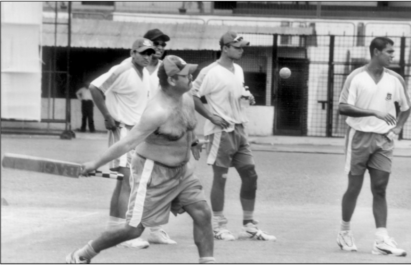
TOO HOT TO PRACTISE: Coach of the national team Dav Whatmore gives his charges catching practice at the Bangabandhu National Stadium yesterday.