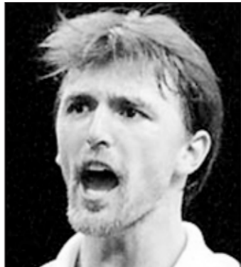
GORAN IVANISEVIC Club showpiece. The popular Croatian, who has been dogged by a series of injuries since his Wimbledon win, was knocked out of the Queen's Club event on Monday in the first round