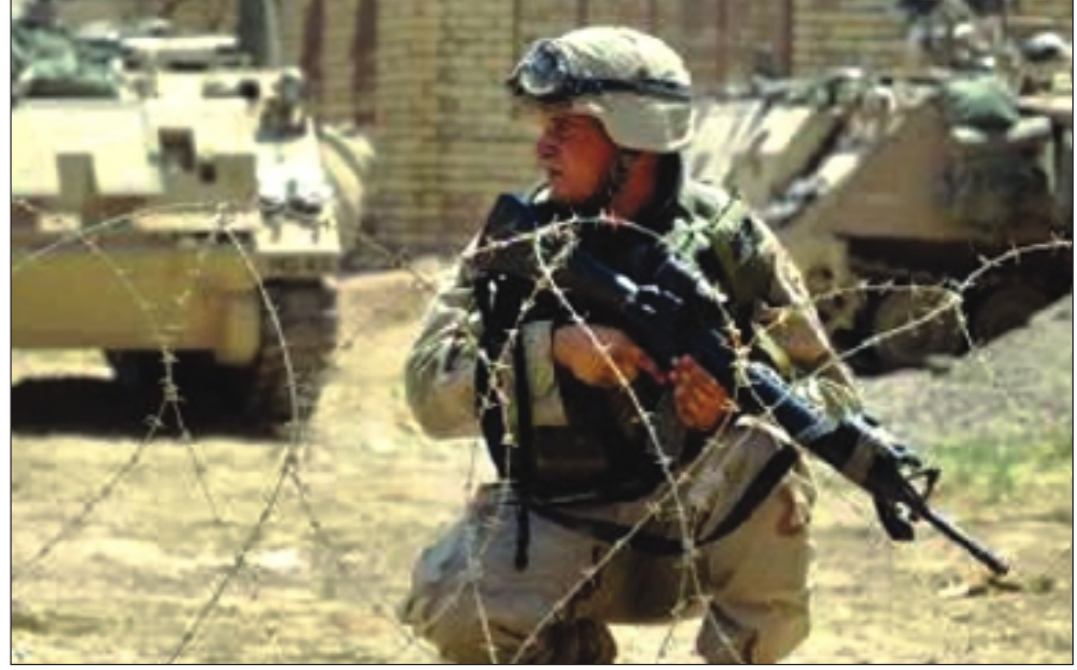
A US Army soldier from Taskforce "Ironhorse" watches the street behind barbed wire in the Iraqi town of Duluiyah during Operation Peninsula Strike Thursday in which coalition forces detained over 400 suspects and seized numerous weapons systems and ammunition.