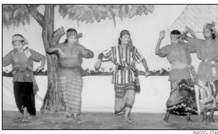
Students enthralled the audience at the dance-drama Rakhalia Banshi.