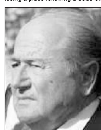
SEPP BLATTER last December.

Brazil and Argentina are leading a South American campaign to add four teams to the next finals in 2006 in Germany to make amends for losing a place following a trade-off