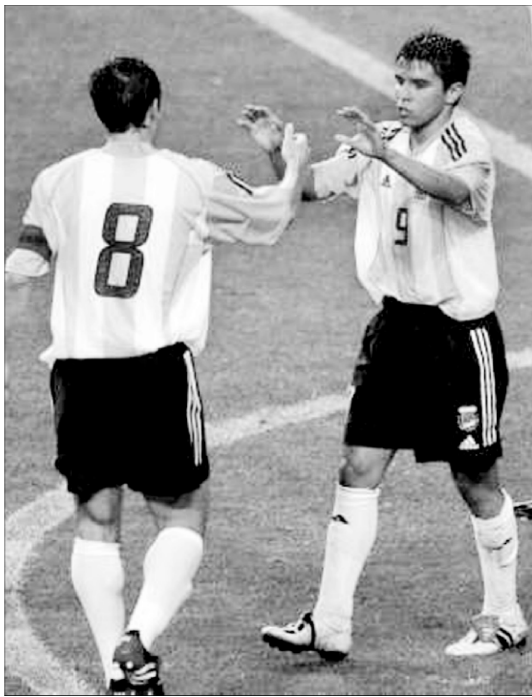
Javier Saviola (No 9) the Argentina striker, being congratulated by team captain Javier Zanetti on scoring against South Korea at Sangam World Cup Stadium in Seoul yesterday.