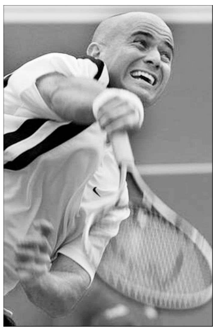
American Andre Agassi follows through on a serve against Peter Luczak of Australia in the second round match of the Queen's Club tennis tournament in London on Tuesday.

Andre Agassi has celebrated his personal millennium with victory at the Stella Artois Championships in his 1,000th professional match.