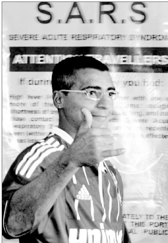
EVERGREEN: Brazilian superstar Romario, wearing the shirt of his new team Fluminense gestures to fans upon his arrival at Rio de Janeiro's international airport on June 9.

"Of course you have your ups and downs with any boss in any job, but it's just a little bit more highlighted with me and him," he added.