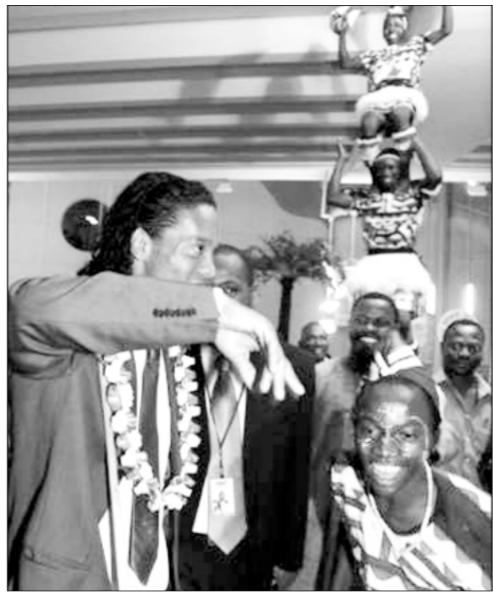
WELCOME TO AFRICA: Brazil's Ronaldo waves to dancers of the Great Odenigbo Cultural Troupe on arrival at Nnamdi Azikiwe Abuja International Airport in Nigeria on June 9.

Nigeria, meeting Brazil for the first time at senior level, have played three times at the new stadium, beating Ghana, Cameroon's Olympic team and Malawi who were crushed 4-1 in an African Nations Cup qualifier last Saturday.