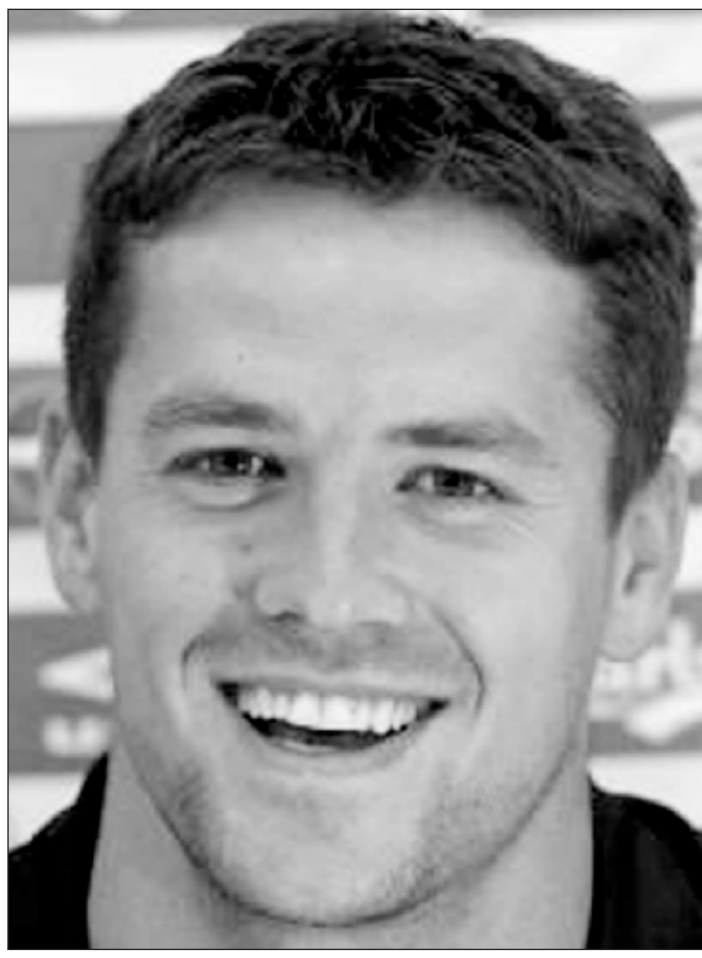
Michael Owen, the stand-in captain of England, in a cheerful mood during a press briefing at Middlesbrough yesterday.