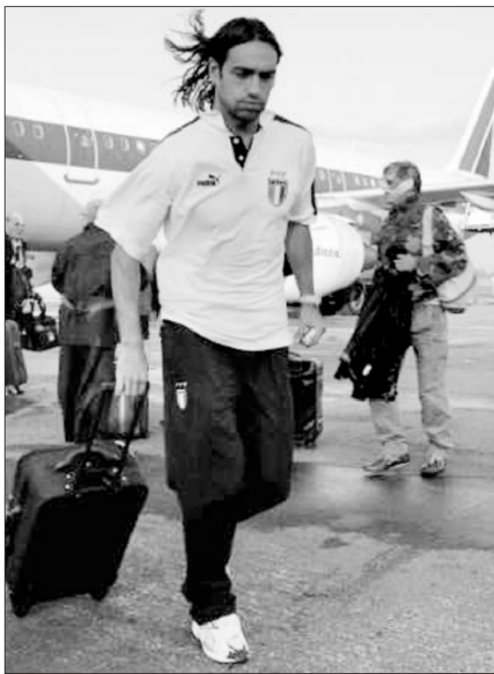
TOUCH DOWN! Italian defender Alessandro Nesta leaves the Alitalia flight that brought the squad to Helsinki on June 9.