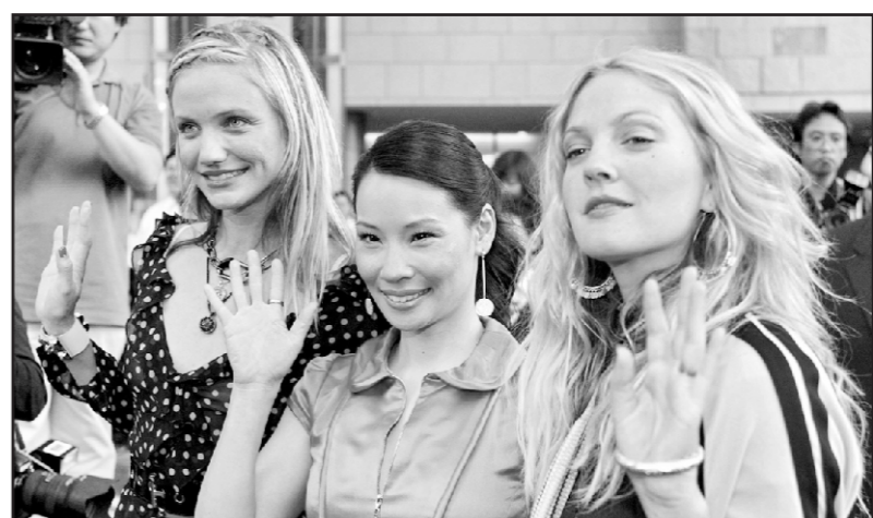
US actress Cameron Diaz (L), Lucy Liu (C) and Drew Barrymore (R) wave to photographers upon their arrival at a press conference in Tokyo 02 June 2003. The three actresses are here to promote their new movie 'Charlie's Angels' which will be shown from 28 June all over Japan.