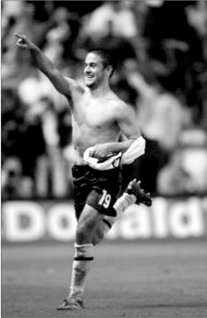
Joe Cole of England is ecstatic as he celebrates scoring the winning goal against Serbia and Montenegro at Leicester on June 3.