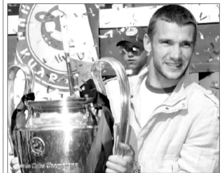
PRIDE OF UKRAINE: AC Milan striker Andrei Shevchenko shows the European Champions League trophy on arrival at Kiev airport on June 3.

The player placed the Cup and a wreath at the site to honour the man who nurtured him as a young player over four seasons at Dynamo before he joined Milan in a 25-million-dollar move in 1999.