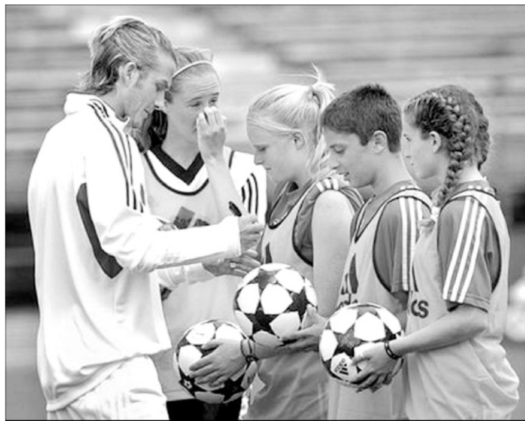
THE IDOL IS HERE! England superstar David Beckham autographing footballs for a group of 14-16-year olds of youth soccer league at Home Depot Centre in Carson, California on June 3. Beckham took a break from a vacation trip to California and joined some 80 kids from all over Southern California as he trained with them but mostly spent his time signing autographs and posing for photos, at the soccer clinic sponsored by an athletic equipment company.

Beckham insisted while on holiday in the United States however that he wanted to stay at Old Trafford.