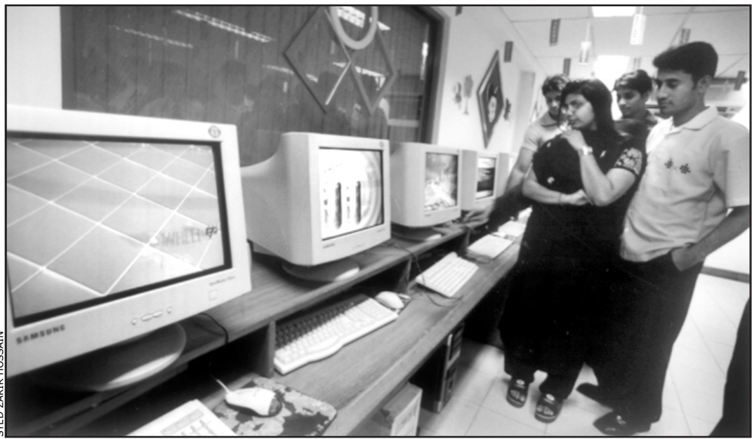
3D animations in TV commercials attracts many visitors at the fair