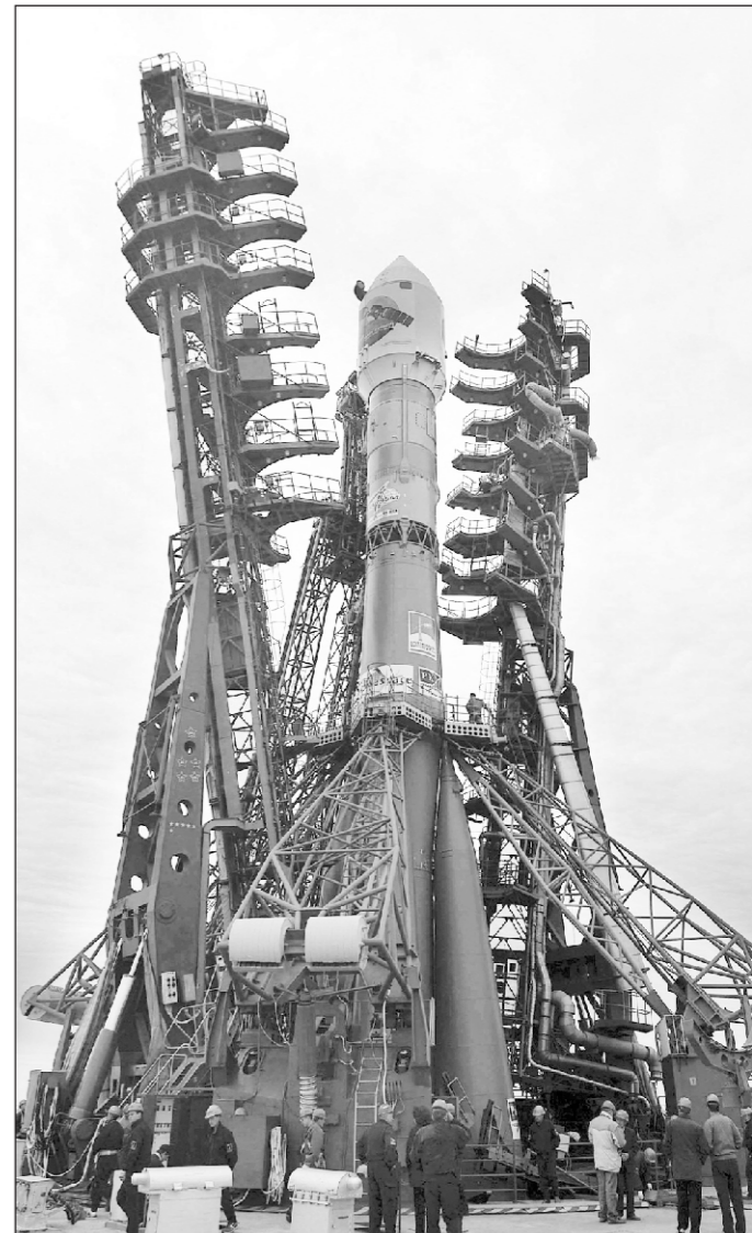
A picture taken on May 29 shows the Soyuz-Fregat launcher being transferred on the launch pad in Baikonur. A European orbiter, Mars Express, has been hoisted aloft by a Soyuz-Fregat launcher from Russia's space Baikonur space base on June 02.