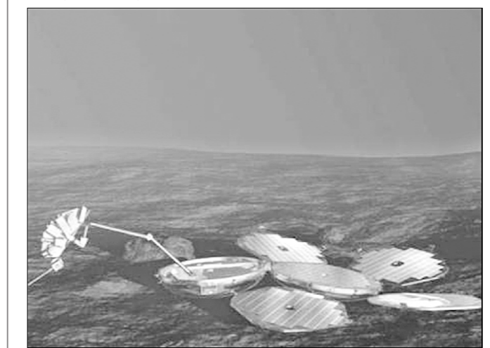
A handout computer generated image, released June 2, 2003, shows the Beagle 2 space probe. The saucer shaped Beagle 2 probe, a British-led project, has been launched from Kazakhstan's Baikonour launch site and will parachute on to Mars in seven months time to transmit the first European pictures of Mars back to Earth.

A drill on the robotic arm will collect samples from within rocks while a mole will crawl slowly across the surface and grab soil from beneath boulders. The samples will be analysed for chemical signs of life using a package of instruments on the lander.