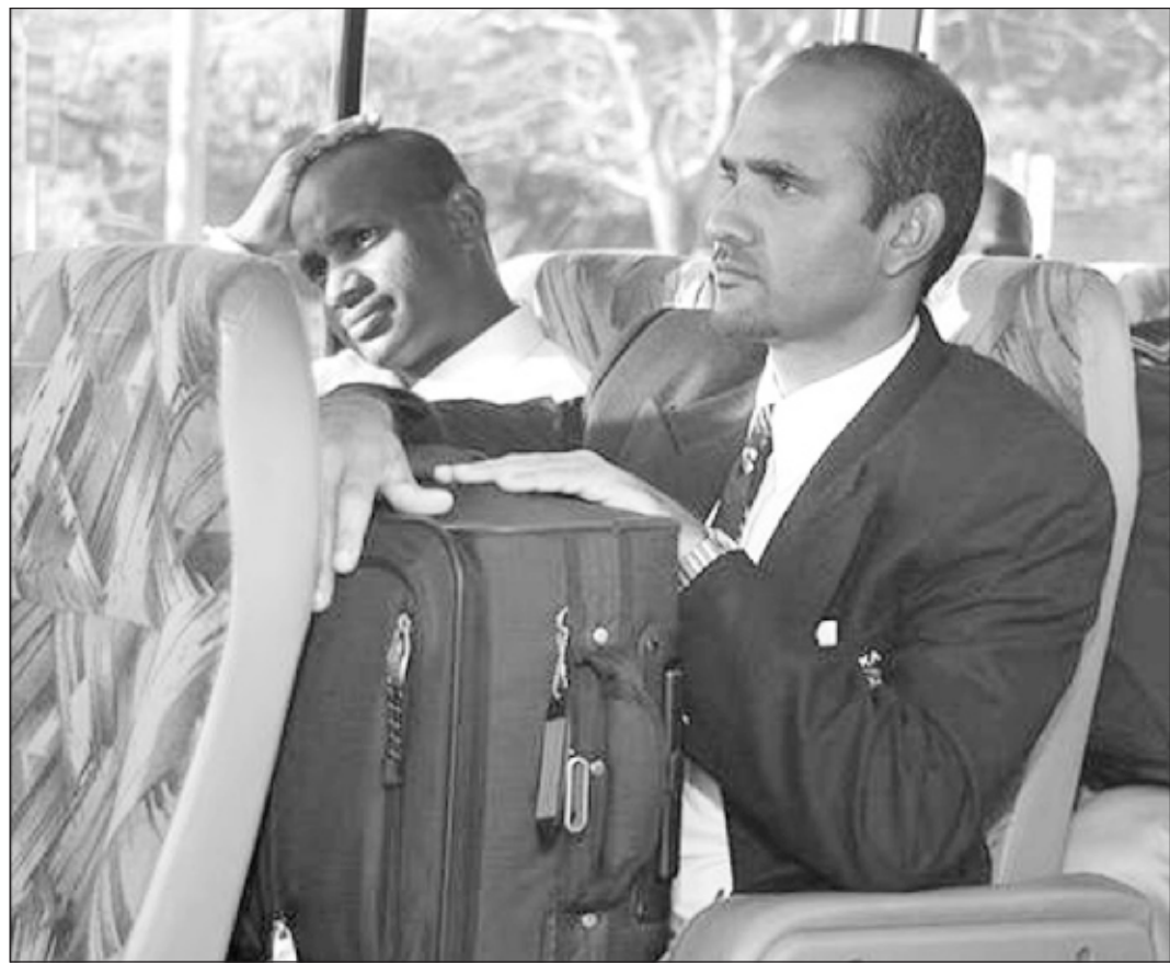
THE PAST AND PRESENT OF LANKA: Sri Lanka's one-day captain Marvan Atapattu (R) and previous captain Sanath Jayasuriya are on way to the team hotel in St. George's in Grenada on June 2. The Lankans arrived in the West Indies to play two Tests and three one-day internationals.