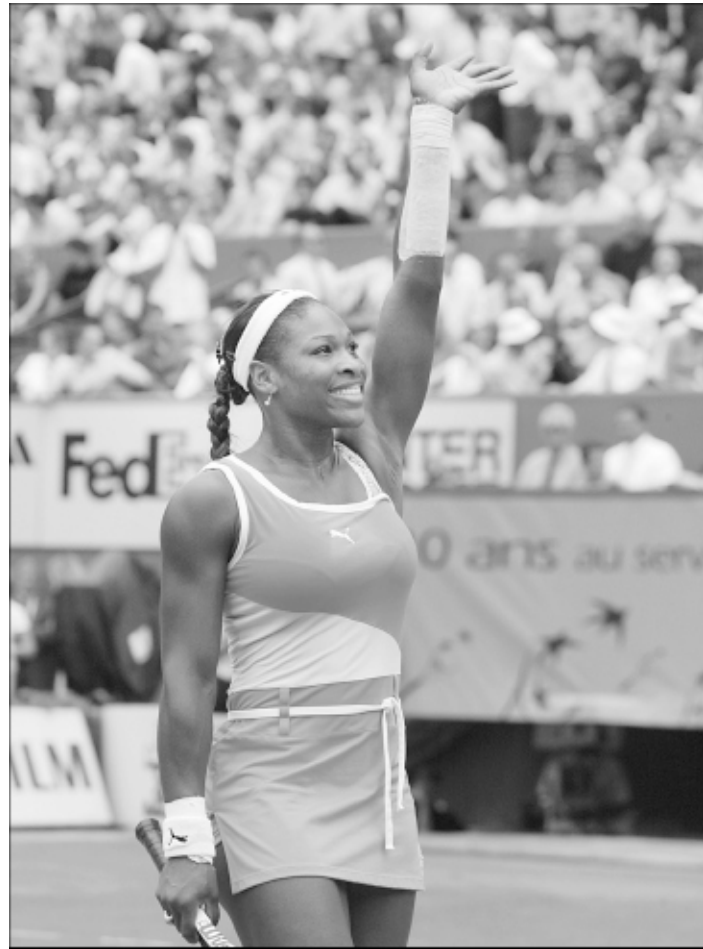
Serena Williams waves to the crowd after defeating France's Amelie Mauresmo yesterday to reach the French Open semifinals.

On Tuesday, however, Serena was irresistible. She motored through the set in 22 minutes, Mauresmo and her compatriots blinking as the winners flew past.