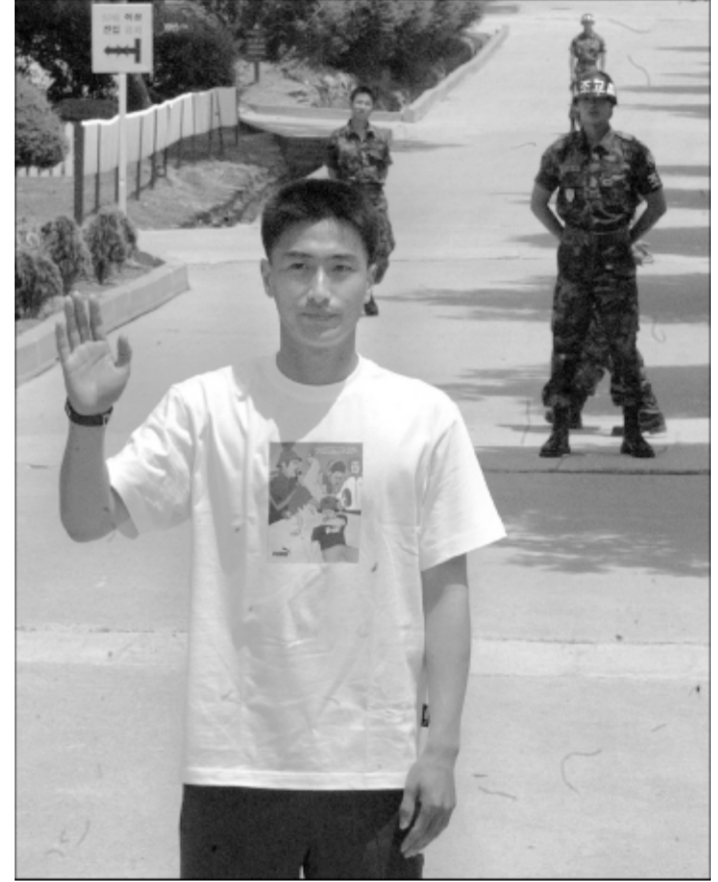
PRAY FOR ME! South Korean superstar Ahn Jung-hwan waves to the press at the entrance of the military training base in Wondang yesterday.

South Korean international striker Ahn Jung-hwan joined the army on Monday with his mane cut short after leading his country to an exciting 1-0 victory over archrivals Japan. Ahn, the World Cup hero who scored a decider to beat Italy last year, struck home in the 86th minute on a Seol Ki-Hyeon pass to give Korea coach Humberto Coelho of Portugal his first win in three games Saturday in Tokyo. The 27-year-old forward joined the "White Horse Unit" on the outskirts of Seoul for four-week military basic training during the month J-League play is suspended for the Kirin Cup and the Confederations Cup. Korean men are required to perform 26 months of compulsory army service, but Ahn and other football players were allowed to avoid it following South Korea's success at the World Cup last year. South Korea changed the national service law to reward the team's success in moving beyond the first round. The Koreans went on to beat Italy 2-1 and Spain 5-3 in a penalty shootout to become the first Asian nation to reach the World Cup semi-finals. They lost to Germany 1-0 in the semi-finals and to Turkey 3-2 in a third place playoff. After basic military training, Ahn was allowed to serve three years in the public sector of his choosing, including football. According to the Yonhap news agency, Ahn returned home Sunday and paid a visit to the barber, his first in a decade, to cut his hair to army length.