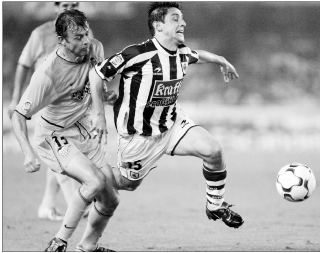
Real Sociedad's Nihat Kahveci (R) being tripped by Valencia's Amedeo Carboni at the Anoeta stadium in San Sebastian on June 1.