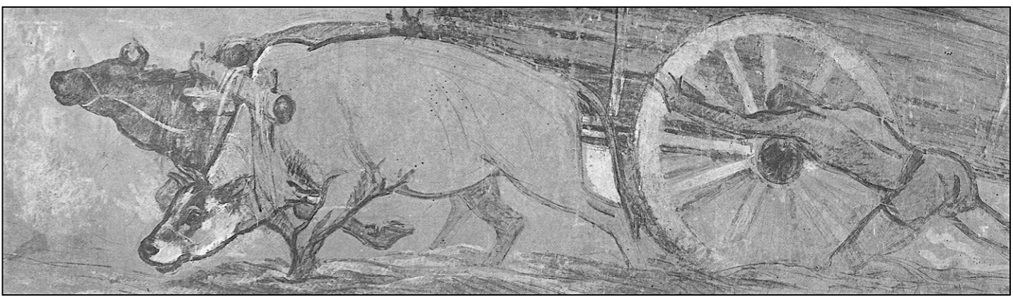
The struggle, 1956.