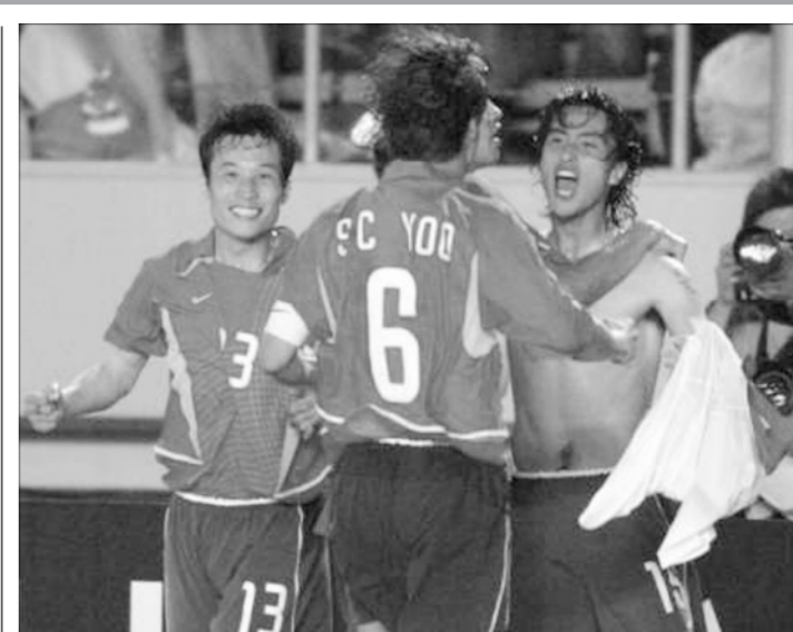
South Korea striker Ahn Jung-hwan (R) celebrates with captain Yoo Sang-chul (No 6) and teammate Lee Eul-yong after scoring the only goal against Japan during the international friendly at Tokyo's National Stadium yesterday.

When they return from their current West Indies tour, the Australians' remaining Tests for the