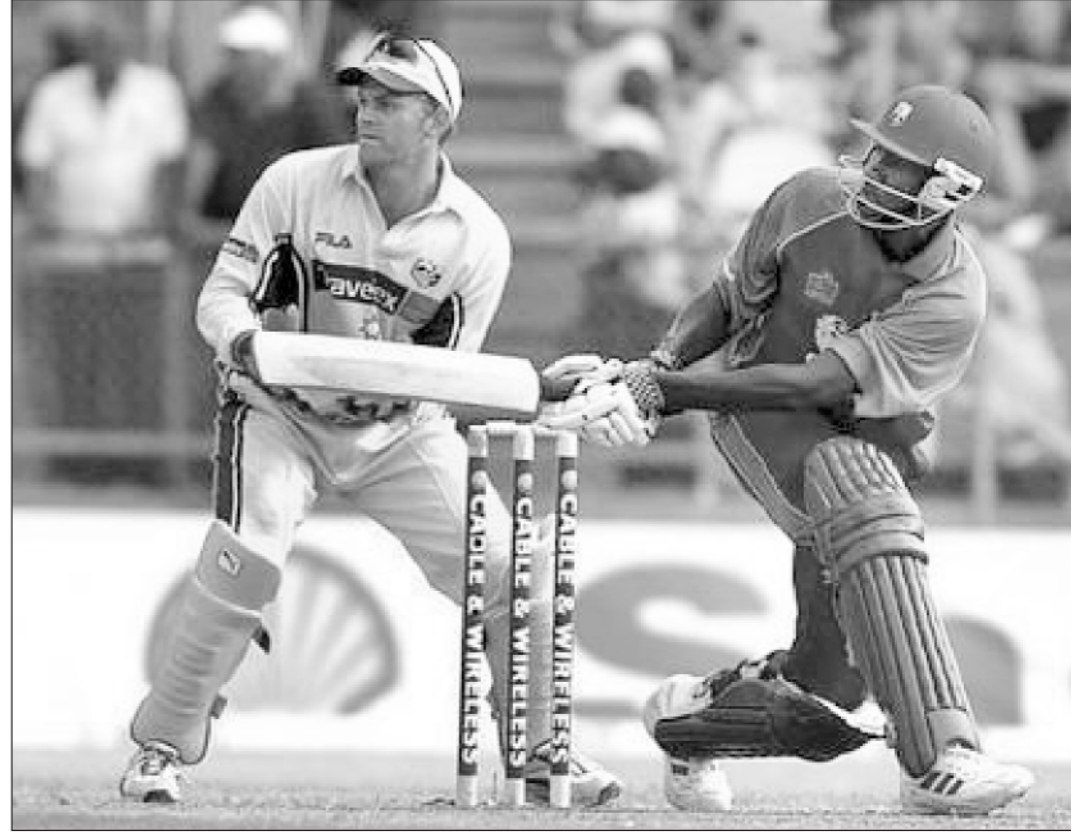
MAN-OF-THE-MATCH: West Indies' Wavell Hinds sweeps fine during his match-winning knock of 125 not out against Australia in the sixth one-day international at the Queen's Park Stadium in St. George's on May 30.