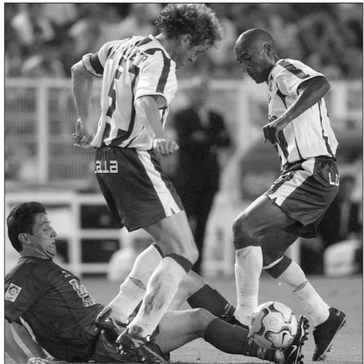
Real Sociedad's Turkish star Nihat Kahveci (on the ground) vies with two Malaga defenders at La Rosaleda stadium in Malaga on May 25.

ahead of me. I intend to carry on until I stop enjoying playing."