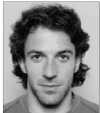
ALESSANDRO DEL PIERO

Three Italian clubs reached the last four of the Champions League this season, with Inter Milan losing