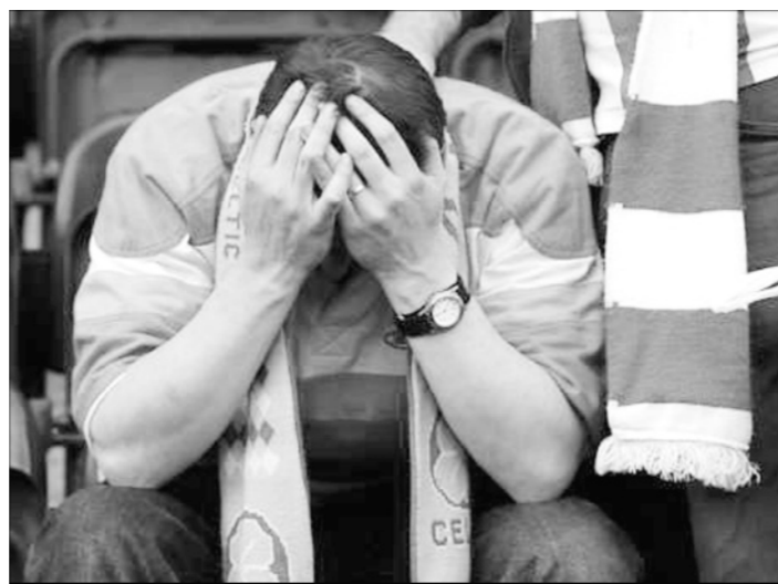
SEASON OF HEARTBREAKS: A desolate Celtic fan at the end of their final Scottish Premier League match against Kilmarnock at Rugby Park in Kilmarnock on May 25.

Stilian Petrov gave Celtic hope right to the end with an 83rd minute strike but the Hoops were unable to add to their tally.