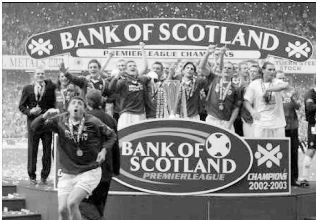
RANGERS RULE: The Glasgow Rangers squad led by Georgian striker Shota Arveladze (Front), celebrate their title win at the Ibrox Stadium in Glasgow on May 25.

The late drama reflected an afternoon of astonishing tension in which the advantage repeatedly