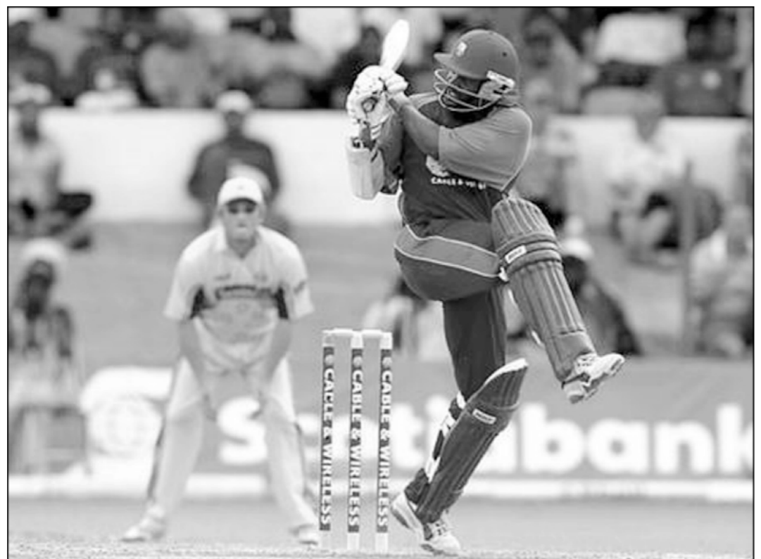
THAT'S LARA: West Indies captain Brian Lara executes one of his trademark pull shots during the fifth one-day international against Australia in Port-of-Spain on May 25. Lara scored 80 and was adjudged man-of-the-match.