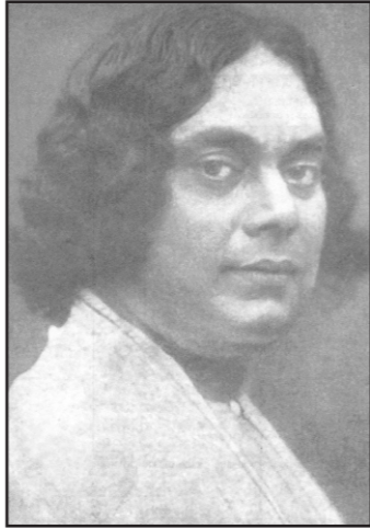
Kazi Nazrul Islam, the personification of Bengali literature.