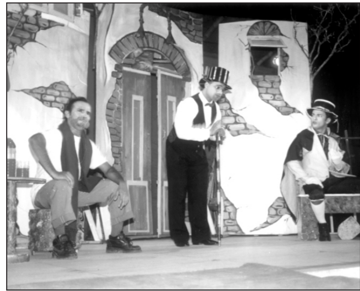
A still from the play 'Georges Dadin ou le mari Confondu'

He adds, "The setting is a large old house, which once belonged to some landlord, and which Georges had bought in order to renovate. Some action takes place beside the stage, at times, and such as when the forest is