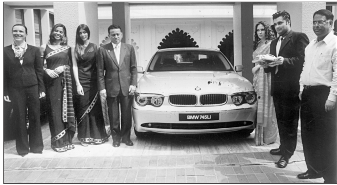
Commerce Minister Amir Khosru Mahmud Chowdhury along with other people poses in front of a BMW car in Dhaka yesterday. Germany's premium car manufacturer BMW has officially entered Bangladesh market with its exclusive distributor Executive Motors.

Russia, the largest buyer of American chicken leg quarters, also has incurred US displeasure by announcing new quotas on foreign poultry, pork and beef.