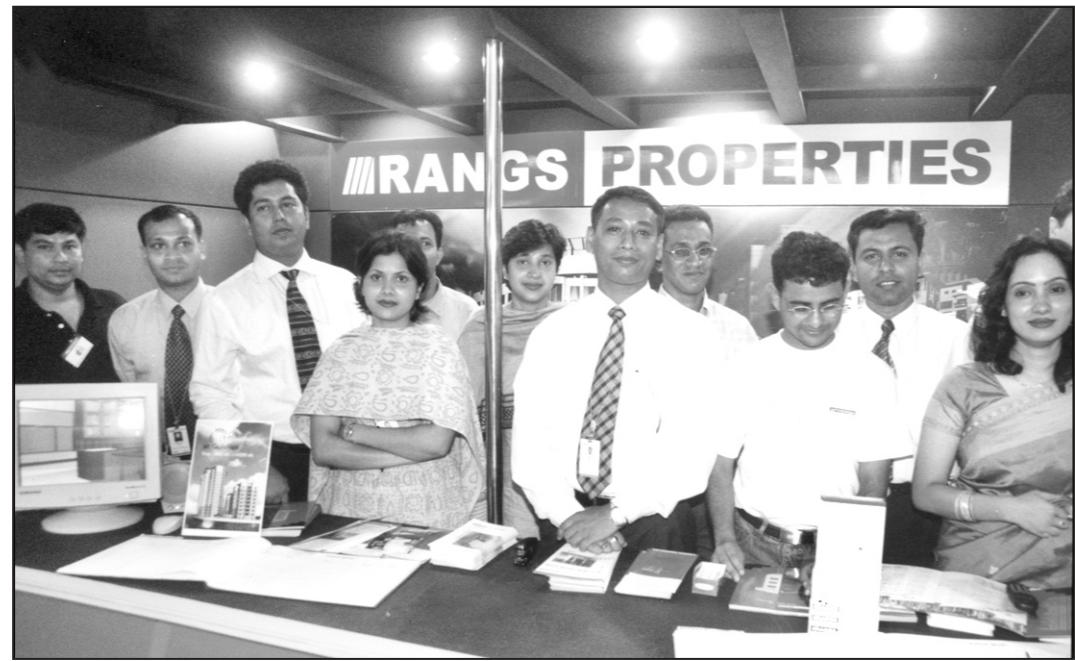
A group of people poses for a photograph at a stall at the three-day DBH Property Fair 2003 that kicked off yesterday at Dhaka Sheraton Hotel.

Targeting the upper-middle and middle class buyers, developers are offering apartments and commercial complexes with a combination of shops, mini-malls