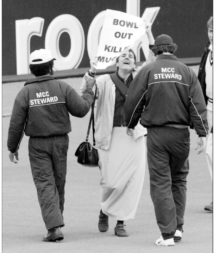
Stewards escort a protester off the ground during the first Test between England and Zimbabwe at Lord's yesterday.

in the seven-game series and needing just one more win in the last four games in Port of Spain this