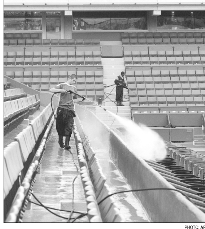
Workers clean the Centre Court stands at Roland-Garros stadium in Paris on May 21 ahead of the French Open which starts on May 26.