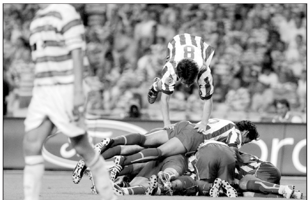
ON CLOUD NINE: FC Porto players celebrate their winning goal against Celtic at Seville on May 21.

But Yuvraj, who has played over 70 one-day internationals, is set to make his Yorkshire debut on Wednesday following Anthony McGrath's call up into the England squad for the first Test against Zimbabwe.