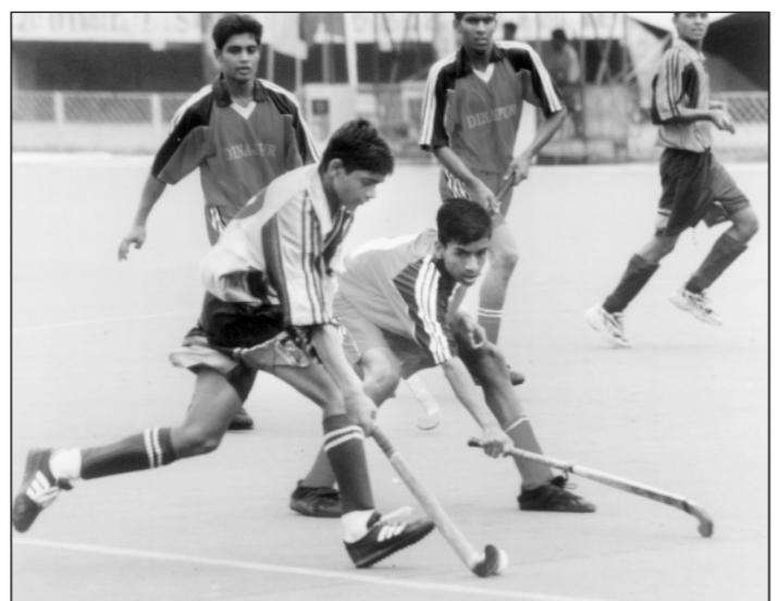
Action from the National Youth Hockey Championship semifinal between Dhaka and Dinajpur at the Maulana Bhasani National Stadium yesterday.