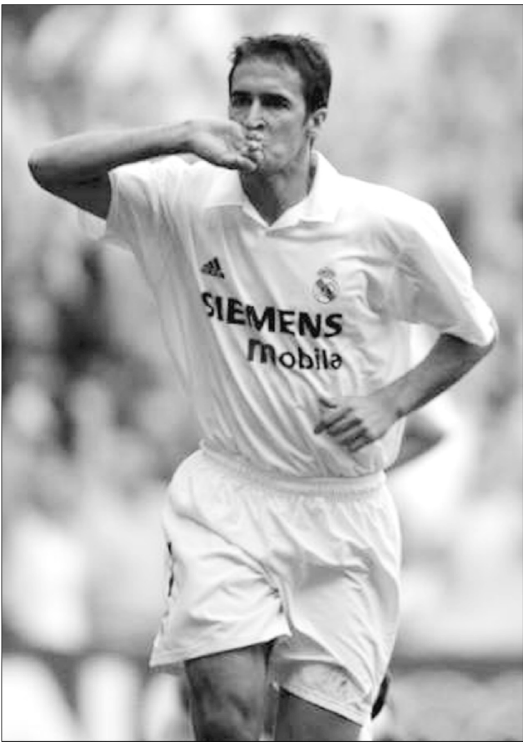
Real Madrid superstar Raul Gonzalez celebrates in his unique fashion after scoring against Malaga at the Santiago Bernabeu's Stadium on May 18.

Leaders Sociedad visit Malaga while Depor have a tricky away match against Galician neighbours Celta Vigo.