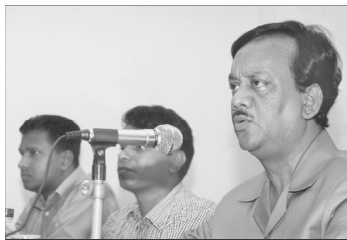
State Minister for Youth and Sports Fazlur Rahman speaks during the 'Meet the Reporters' programme at the Dhaka Reporters' Unity auditorium yesterday.