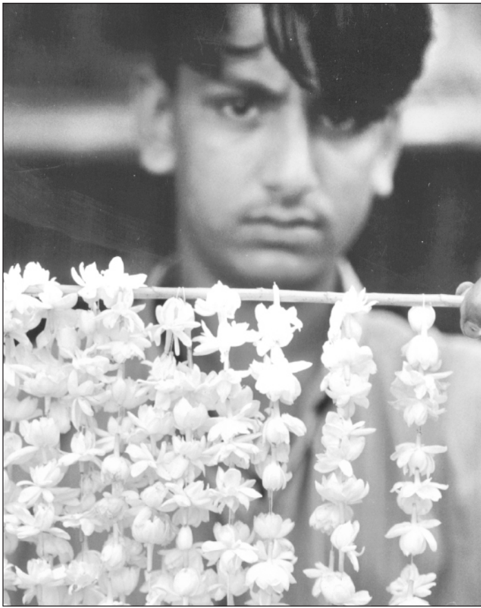
SYED ZAKIR HOSSAIN

Hazrat Ali from Narayanganj sells beli flowers in Dhaka, wandering across the city to hook the attention of buyers. "Men and women love beli alike. Women passing by car or taxicab stop for the flower on