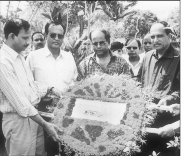
Shawkat Osman Parishad places wreath on the grave of eminent litterateur Shawkat Osman at the Martyred Intellectuals' Graveyard at Mirpur on Osman's 5th death anniversary.

Earlier Shawkat Osman Parishad placed floral wreath on Osman's grave at the Martyred Intellectuals' Graveyard at Mirpur.