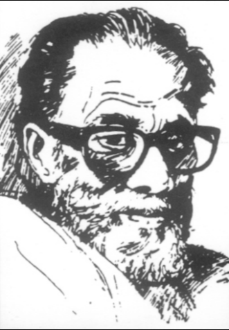
Shaheer Bungalow, Mosquitophone, Khudey Socialist etc.

Among his most important works are novels Boni Adom , Janoni , Kritodash-er Hashi , Jahannam Hoitey Biday , Jalangi , Rajshakkhi , Pitirpurusher Paap , and Rajpurush . He also wrote a few books of poems like Nijoshuvo Shangbad-data Prerito , Sheikher Shambora , and collections of short-stories like Pinirapole , Shabek Kahini , Janno Jodi Tobo Bangey , Puraton Khanjar . He was also a famous writer among children with his great creation Oten