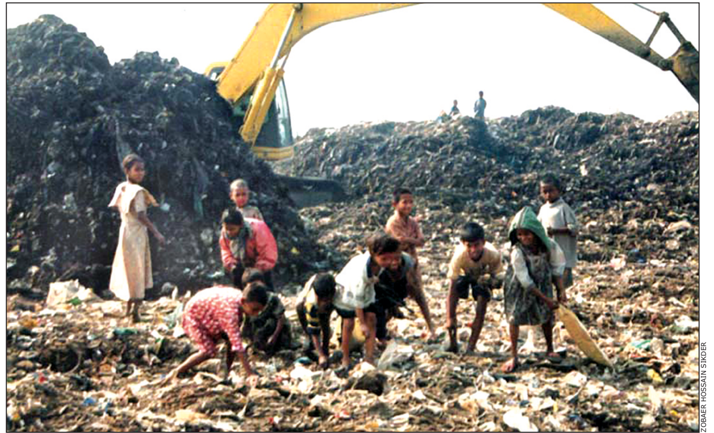
Children picking through garbages to earn a living is a common scene at Chittagong City Corporation's Ananda Bazar dumping ground at Halishahar.