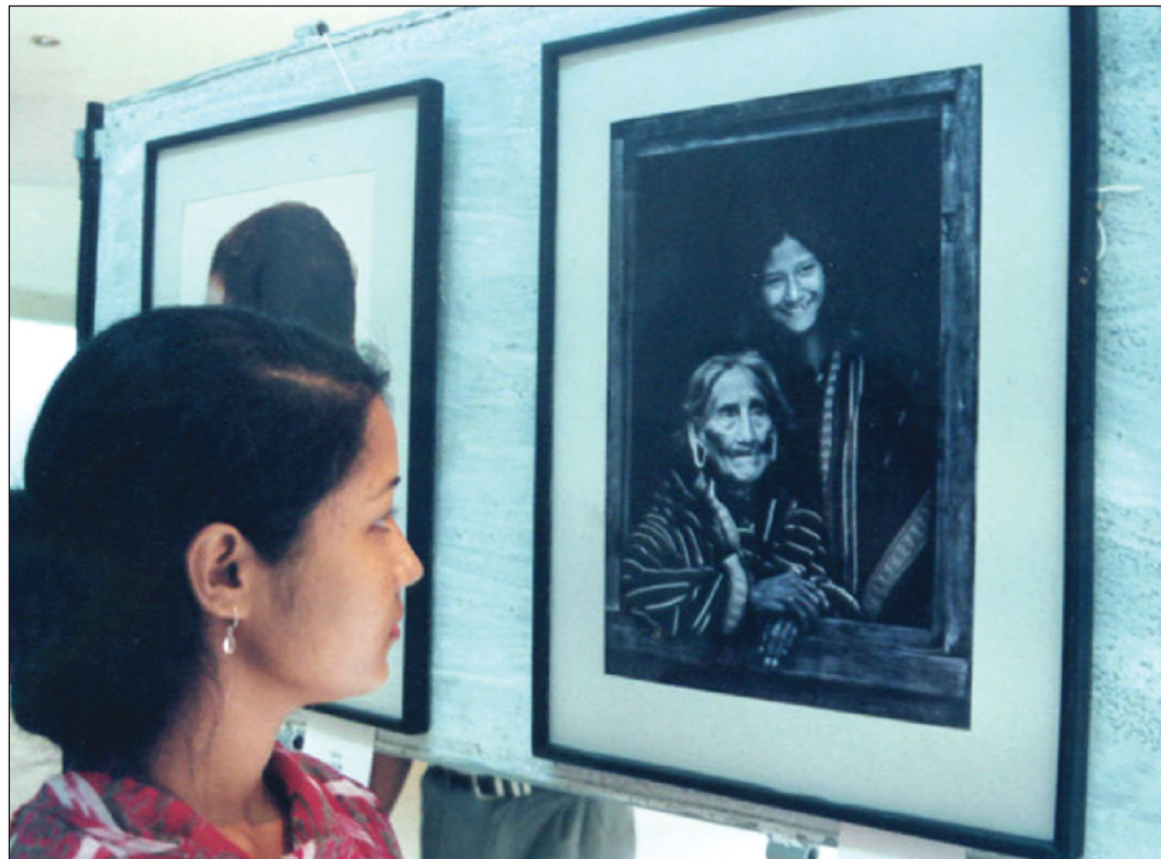
A woman at the CPS International Photo Exhibition at the Chittagong Government Art College gallery.

The stones of over Tk. 5 lakh were collected at Lama in February and March this year.