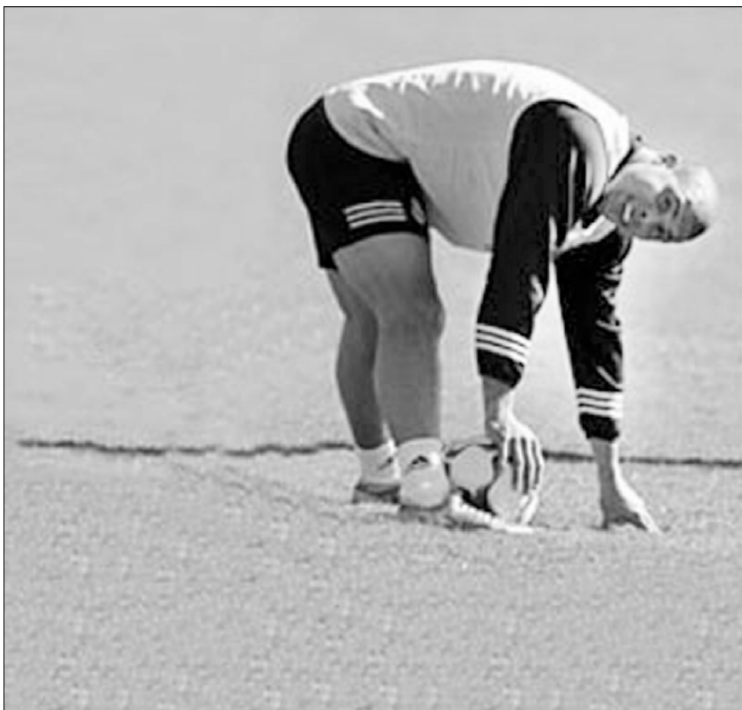
ANXIOUS WAIT: Real Madrid superstar Ronaldo stretches during a training session in Madrid on May 11.