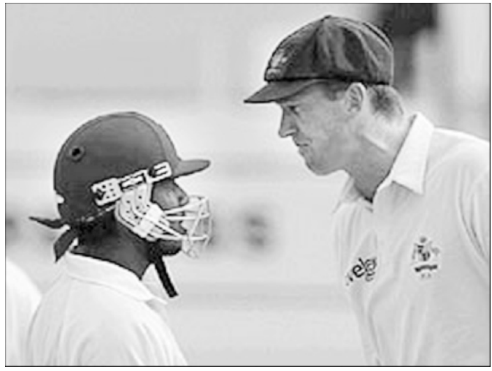
WHAT ARE THEY DISCUSSING! Ramnaresh Sarwan and Glenn McGrath are engaged in an on-field altercation on the fourth day of the fourth Test at Antigua on May 12.

"It happens to us occasionally when either individuals or the other side basically confronts us in a sense of challenging the emotions of the players and ... we tend to lose our composure," Buchanan told a Sydney radio station from Antigua on Tuesday.