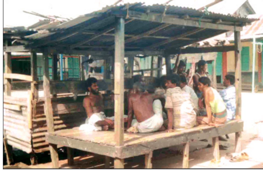
Workers laze out at a hub of hilsha in Barisal, as they have no work these days. Hilsha is not found in plenty, although its season began in early April.