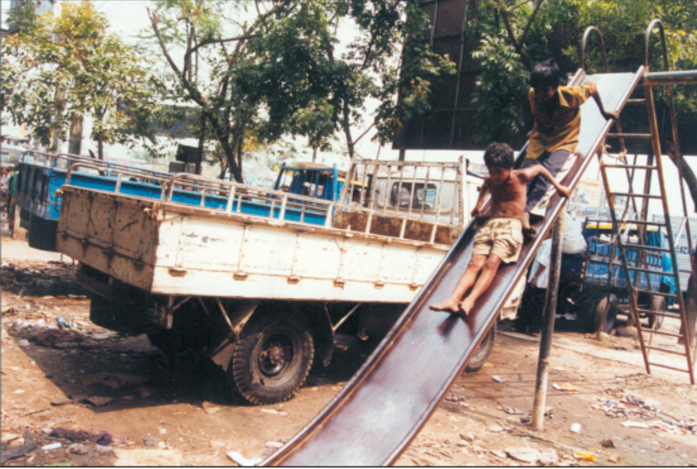
Two boys glide down a slide yesterday at the children's park at English Road in Old Dhaka. Built around 20 years ago, the park nowadays is a hangout for drug addicts. To make matters worse, trucks and vans use it as a makeshift stand.