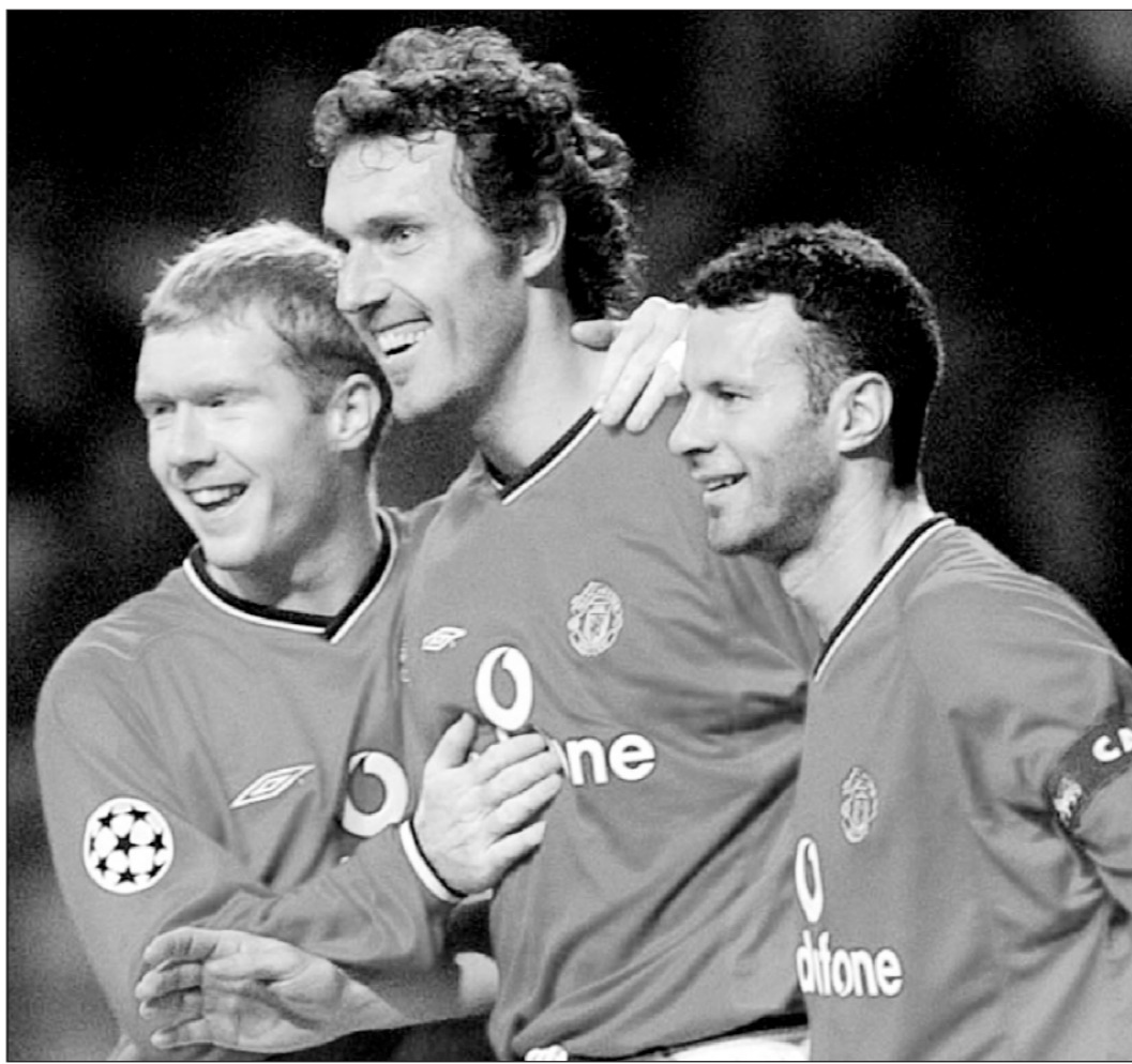
A file photo shows Manchester United's French defender Laurent Blanc (C) is being congratulated by teammates Paul Scholes (L) and Ryan Giggs after he scored against Boavista during the Champions League. Blanc will be playing the final match of his career against Everton today.

"Fifth would make it a good season but it could be a great season. I prefer a great season."