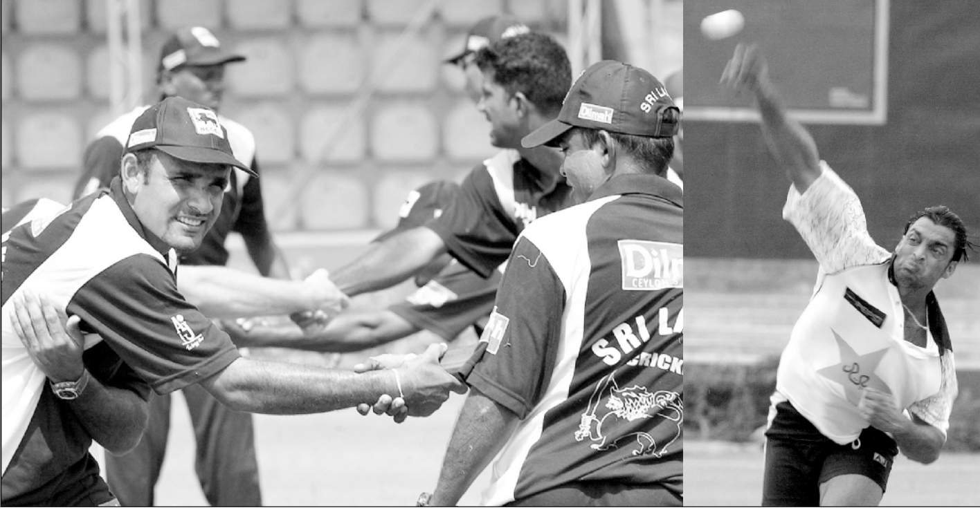
(L) Sri Lankan players join hands while (R) Pakistan fast bowler Shoaib Akhtar warms up in the nets at the Dambulla Stadium yesterday. Both teams face each other today in a one-day international.