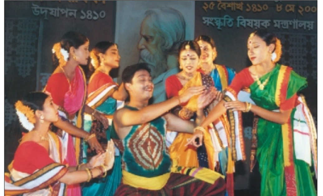
Artistes synchronise a dance sequence at a cultural event organised by the cultural affairs ministry at the