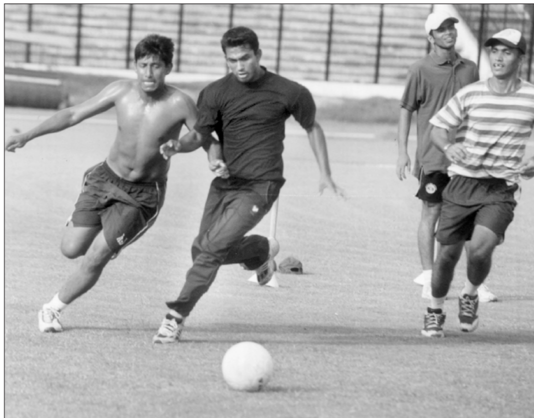
Victoria cricketers warm up with a game of football during practice at the Bangabandhu National Stadium yesterday.

On the other hand, Mohammedan, who are playing their last