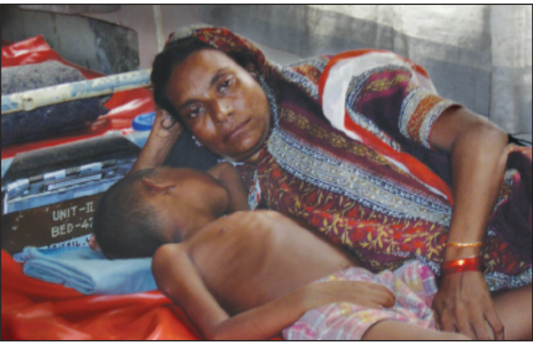
A child with diarrhoea sleeps in a bed while his mother looks on at the International Centre for Diarrhoeal Diseases and Research, Bangladesh (ICDDR,B) in Dhaka yesterday.