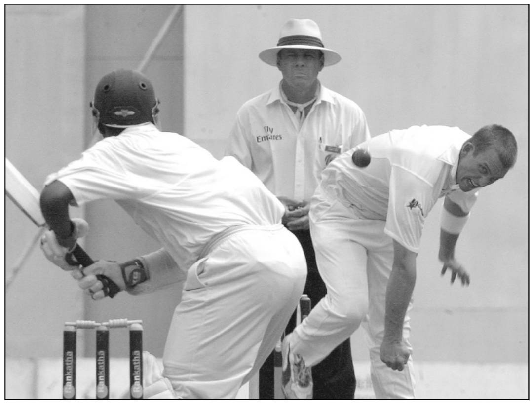
Sri Lanka skipper Hashan Tillakaratne is ready as New Zealand fast bowler Shane Bond delivers a ball on the fourth day of the second Test at Kandy yesterday.