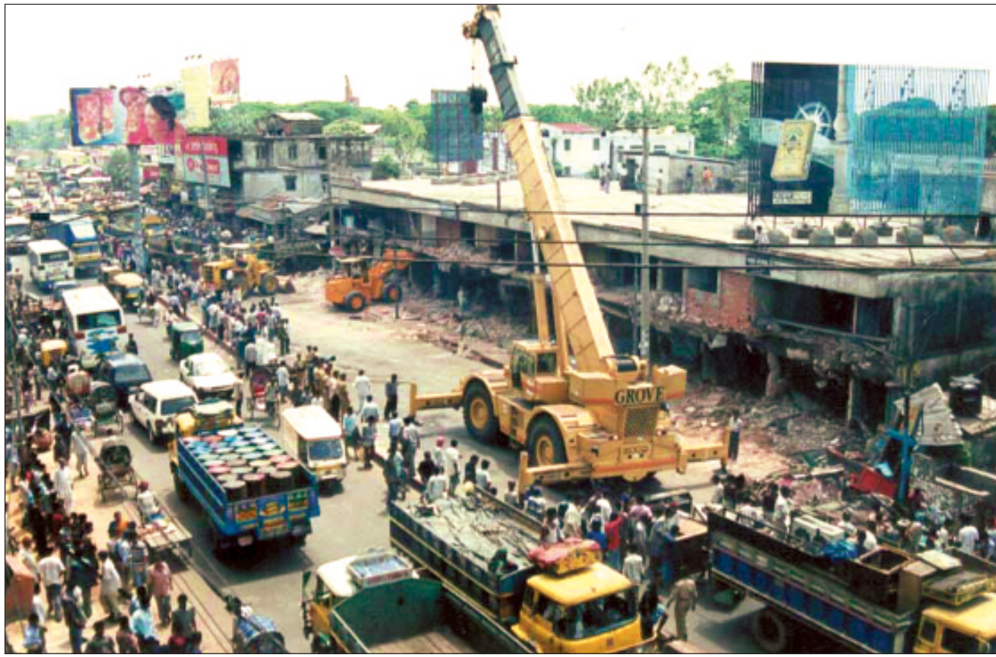
The Chittagong Port Authority runs an eviction drive yesterday at the Agrabad Barik Building intersection in Chittagong.