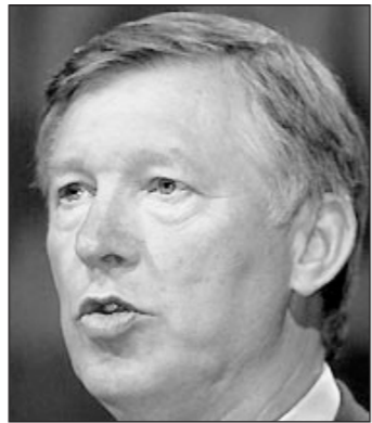
SIR ALEX FERGUSON

United boss Alex Ferguson must decide whether to recall Fabien