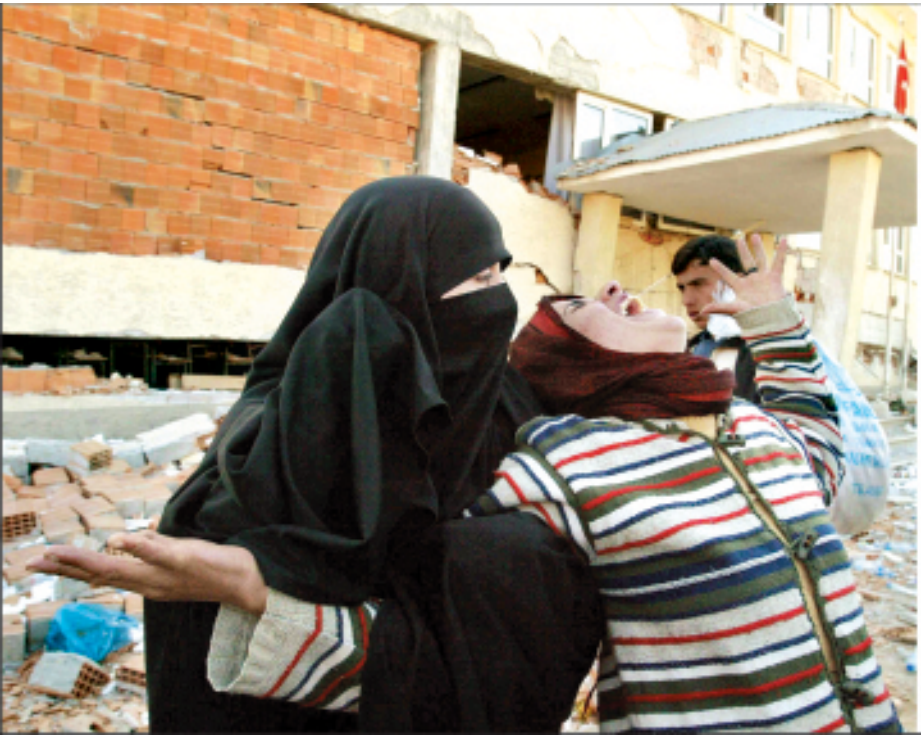
A Turkish woman, left, crying for her child who in the ruins of the collapsed school is comforted by a friend in Celtiksuyu, Bingol, yesterday. Rescue workers, right, search the rubble of a boarding school's dormitory where students are trapped in Celtiksuyu. Up to 150 people, including sleeping children, were killed and scores more trapped under rubble when a powerful earthquake jolted eastern Turkey early Thursday, flattening the dormitory.