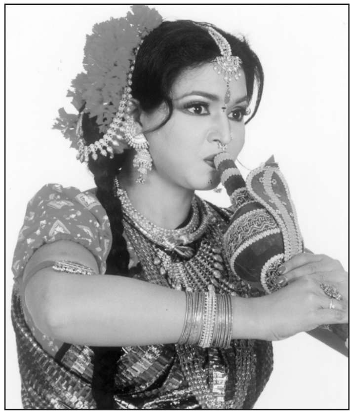
'Been'—the snake charmer's flute—is an integral instrument for the Jhapan songs.

Re-launching of cassettes and CD's and the preservation of old records still available at the radio and TV centres should be the first priority. Along with this, connoisseurs who have a large collection should be contacted and the tapes should be taken care of, lest we risk locking away our proud heritage to long lost memories.