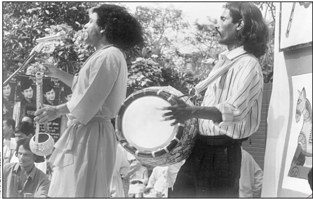
Bauls and their heritage have achieved a remarkable place in the hearts of the young and old alike, thanks to the electronic media.