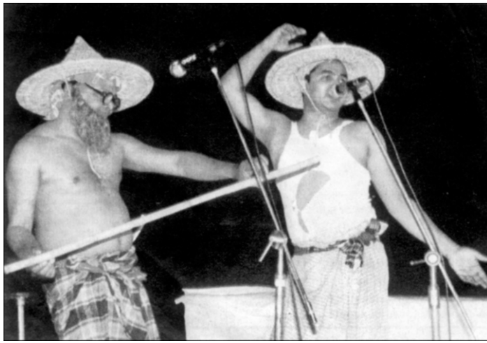
The grandfather and the grandson are the two popular characters of the Gombhira.

The Gombhira songs are presented in a different setting. These songs are popular in northern district of Chapai Nawabganj. Here the songs are set in the form of question and answer between a wise grandfather and his grandson, both coming from the rural background. The villagers learn a lot about modern trends of the city be it education, medicine or politics from the lyrical conversation. Both the grandpa and grandson wear the traditional dress of the farmers—a lungi, a vest and straw hats and