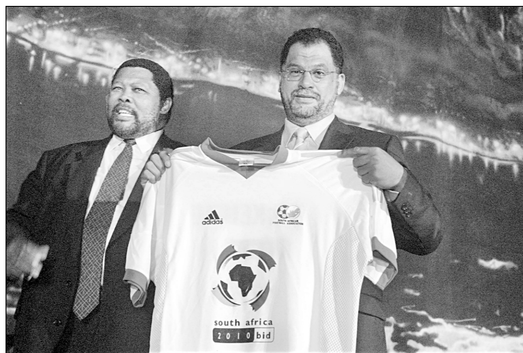
South African Sports Minister Ngconde Balfour (L) and Chief Executive Officer of the 2010 Soccer World Cup Bid company Danny Jordaan hold an official jersey at the national launch of the country's bid for the 2010 FIFA World Cup at a mayoral banquet in Cape Town on April 29.

For 2010, the Libyans would have to see off African rival bids from Egypt, Morocco, Nigeria, South Africa and Tunisia.