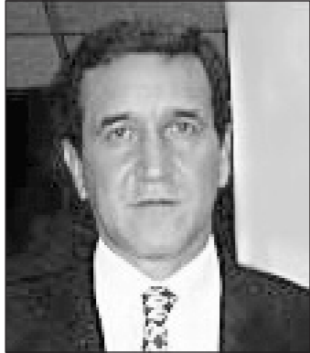
CARLOS ALBERTO PARREIRA

leading Paris Saint Germain into the French Cup final last Sunday.