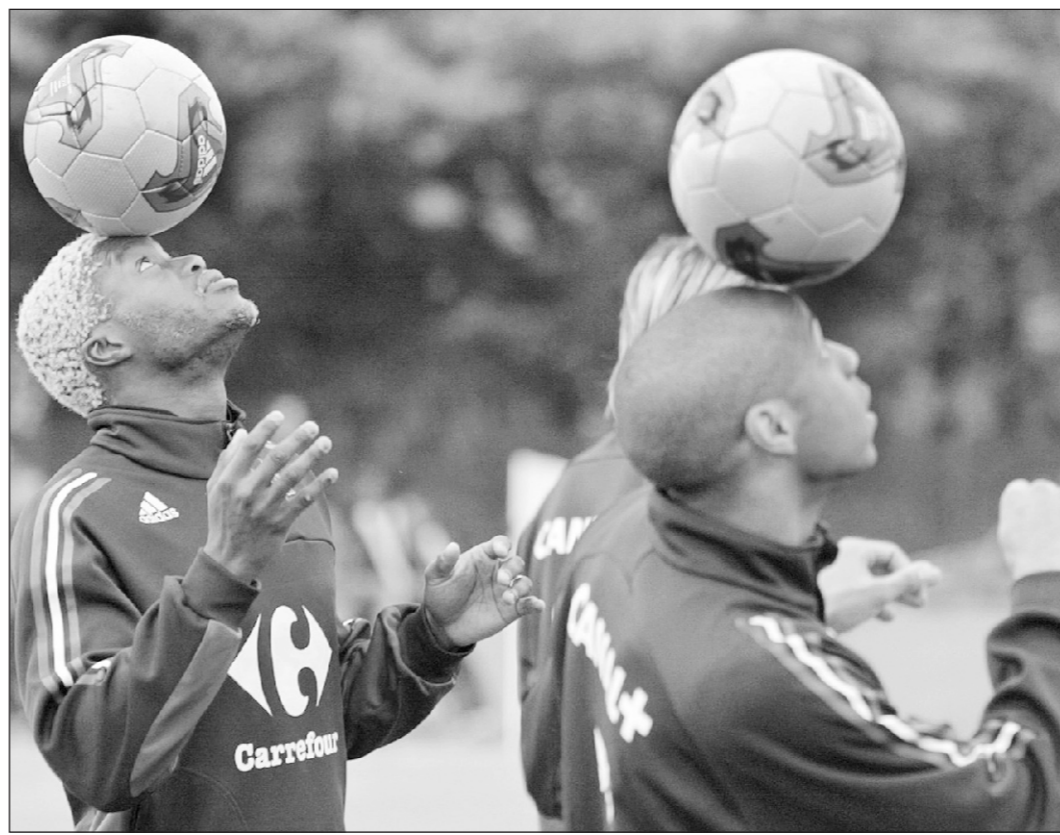
French national strikers Thierry Henry (R) and Djibril Cisse control balls on their heads during a training session at Clairefontaine on April 29 ahead of their friendly against Egypt.

Strikers: Amoroso (Borussia Dortmund/GER), Adriano (Parma/ITA), Ronaldinho (Paris SG/FRA), Ronaldo (Real Madrid/SPA), Diego (Santos), Robinho (Santos)