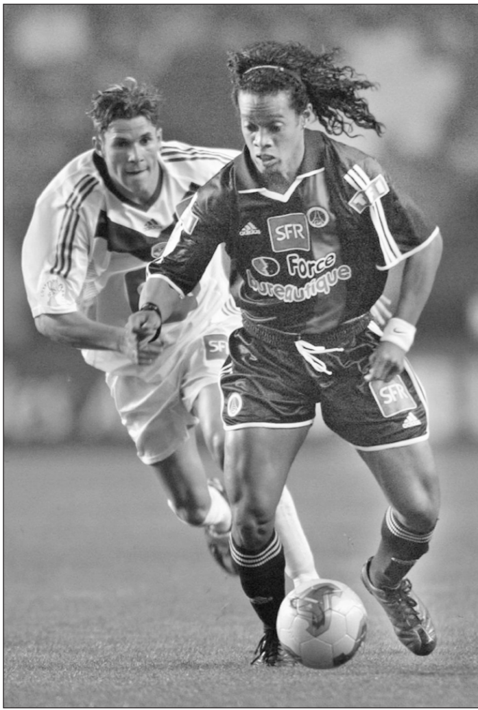
Paris-Saint-Germain's Brazilian superstar Ronaldinho (R) on the move during the French Cup semi-final against Bordeaux at the Parc des Princes in Paris on April 27.