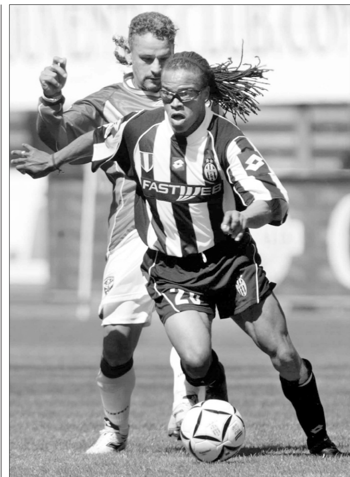
Roberto Baggio (L) of Brescia putting pressure on Juventus Dutch international Edgar Davids at Turin on April 27.