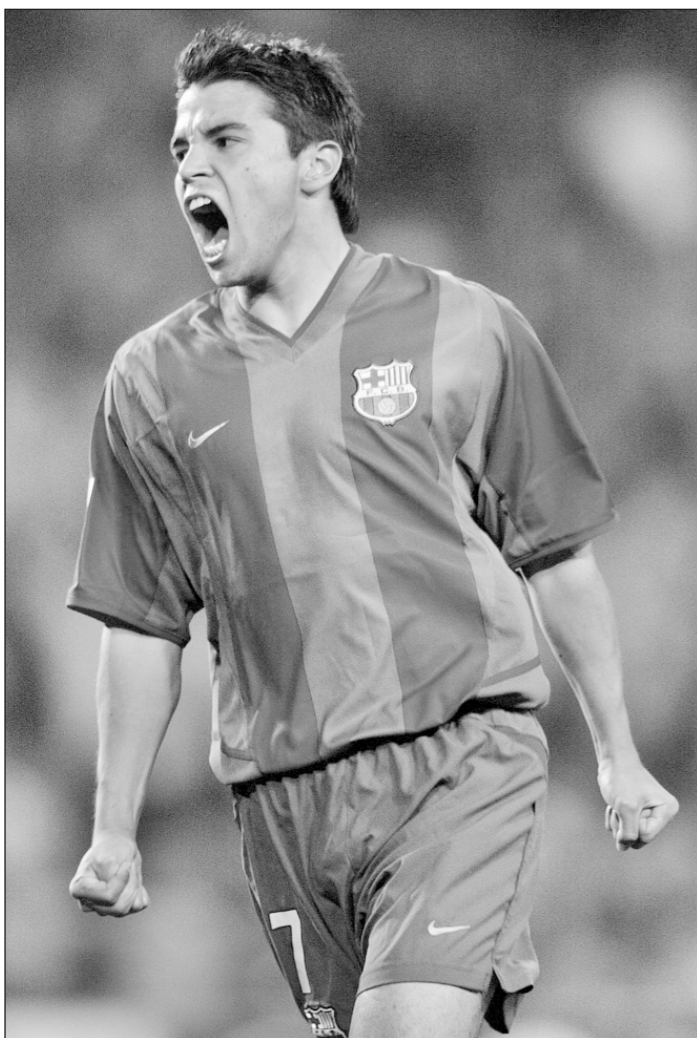
Barcelona's Argentinean striker Javier Saviola is ecstatic after scoring against Real Sociedad at the Camp Nou stadium at Barcelona on April 27.